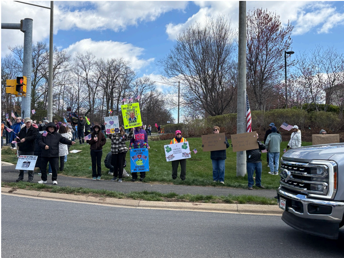
Activists and community members making their voice heard during the March 28th 'No Kings' Protest in Centreville, Virginia.