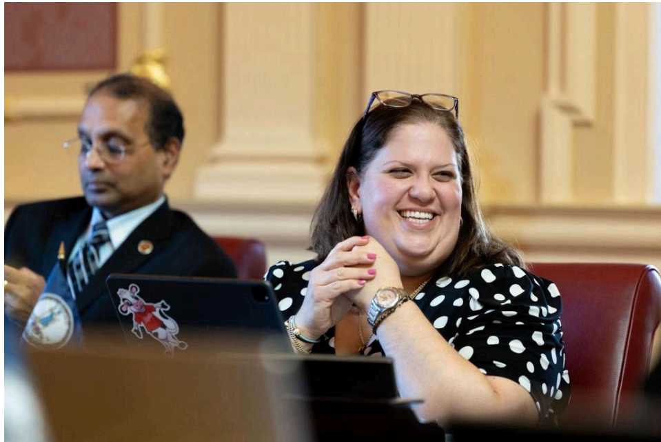
Stella Pekarsky Senator, District 36

Email: senatorpekarsky@senate.virginia.gov