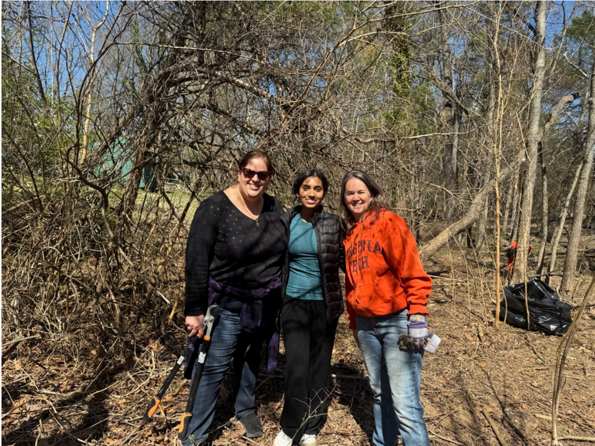
Senator Pekarsky and volunteers at an Invasive Plant Clearing community event in Fairfax County.