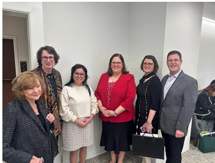
Senator Pekarsky with advocates from the Greater Washington Society of Clinical Social Workers.