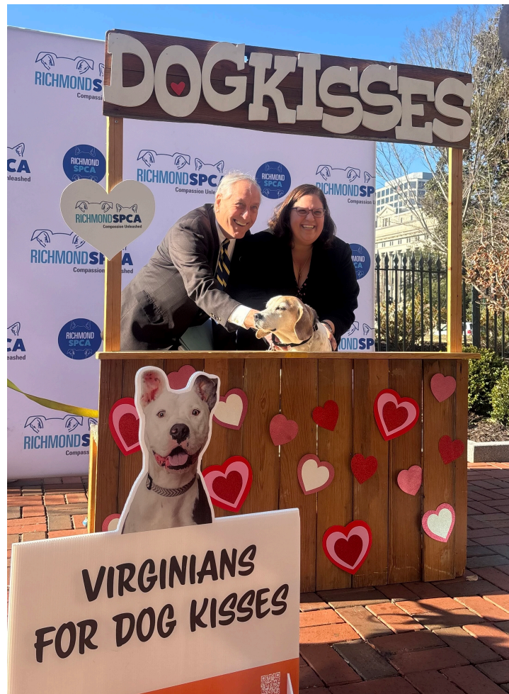
Senator PeKarsky and Senator Marsden on the Capitol Square with Richmond SPCA

We just wrapped up our 5th week of session!