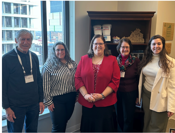
Senator Pekarsky with members from the Jewish Community Relations Committee.