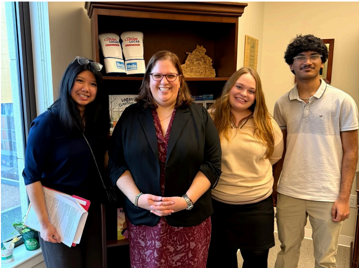
Senator Pekarsky with students from the NOVA Electric CoOp for Students!