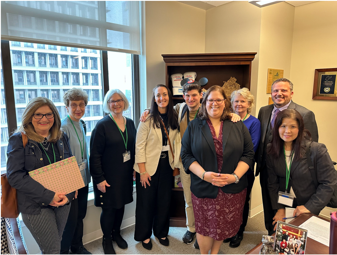
Senator Pekarsky with advocates from CRI: (Choice, Respect, Independence)