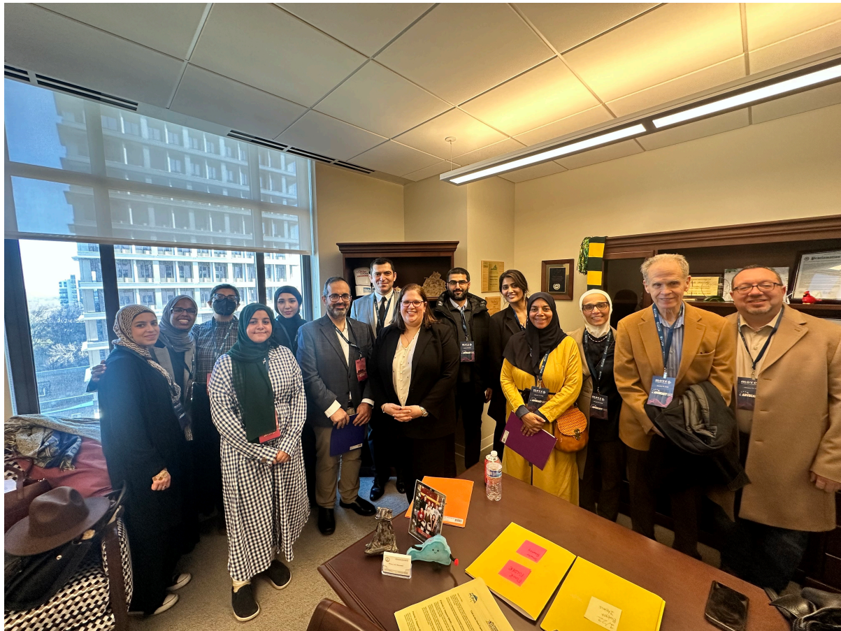
Senator Pekarsky with advocates from Businesses for Muslim Advocacy!