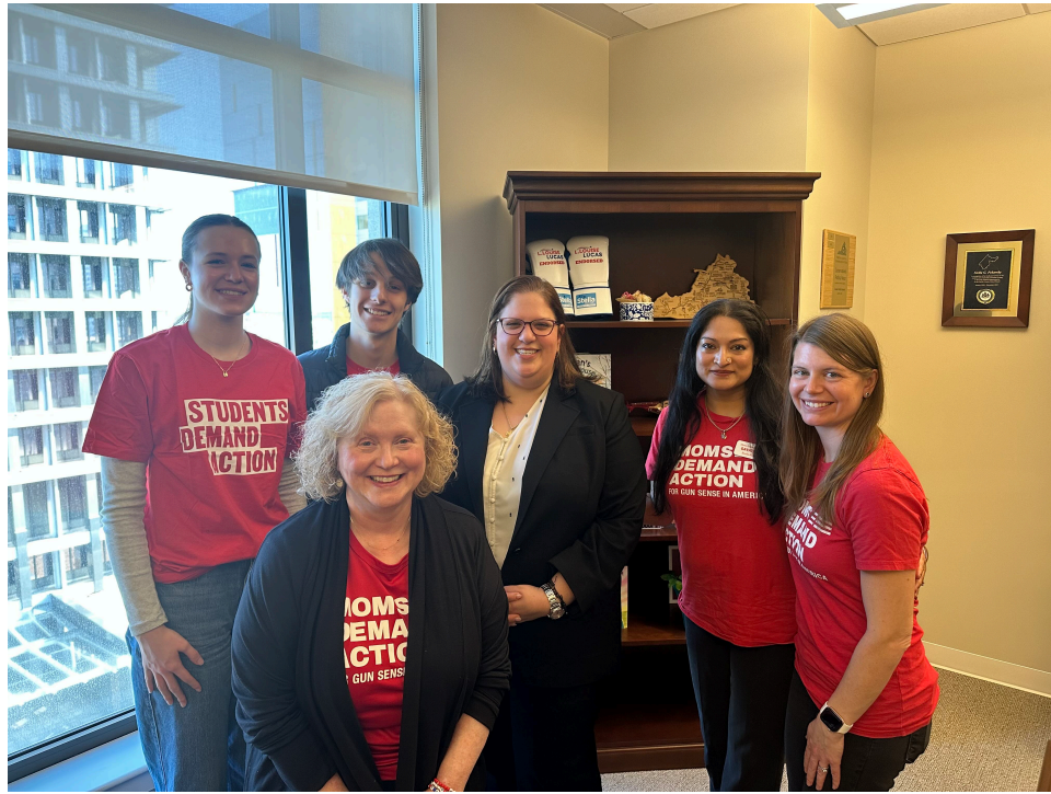
Senator Pekarsky with advocates from Moms Demand Action and Students Demand Action! Thank you all for your staunch advocacy in ending gun violence.