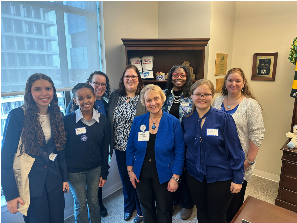
Senator Pekarsky with students and advocates from the Fairfax County Council PTA!