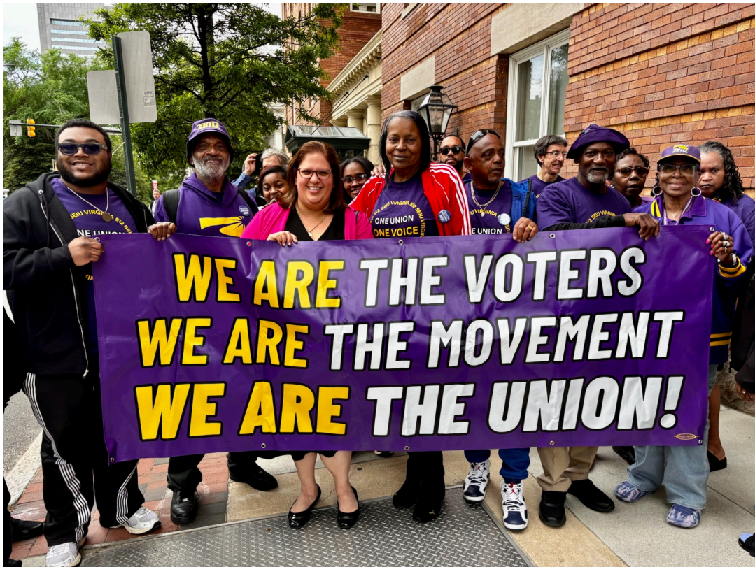
Senator Pekarisky at the Collective Bargaining Rally with VEA representatives and members of SEIU (April 22, 2026)